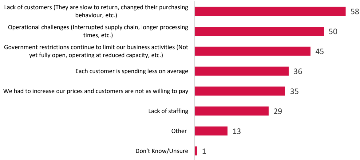
Figure 2: What are the main reasons that your business has not yet returned to normal revenues? (Select all that apply)

Your Voice – February 2022 – National Data – Final results as of Feb.9 – Feb. 25, 2022. n= 4,001. Results less than 2% are hidden*