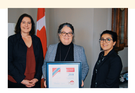
Hon. Diane Lebouthillier, Minister of National Revenue, electronically to their employees.

The fix: The Canada Revenue Agency (CRA) for allowing small business owners to distribute T4s is moving more services online. With Budget 2017, CRA is allowing small business owners